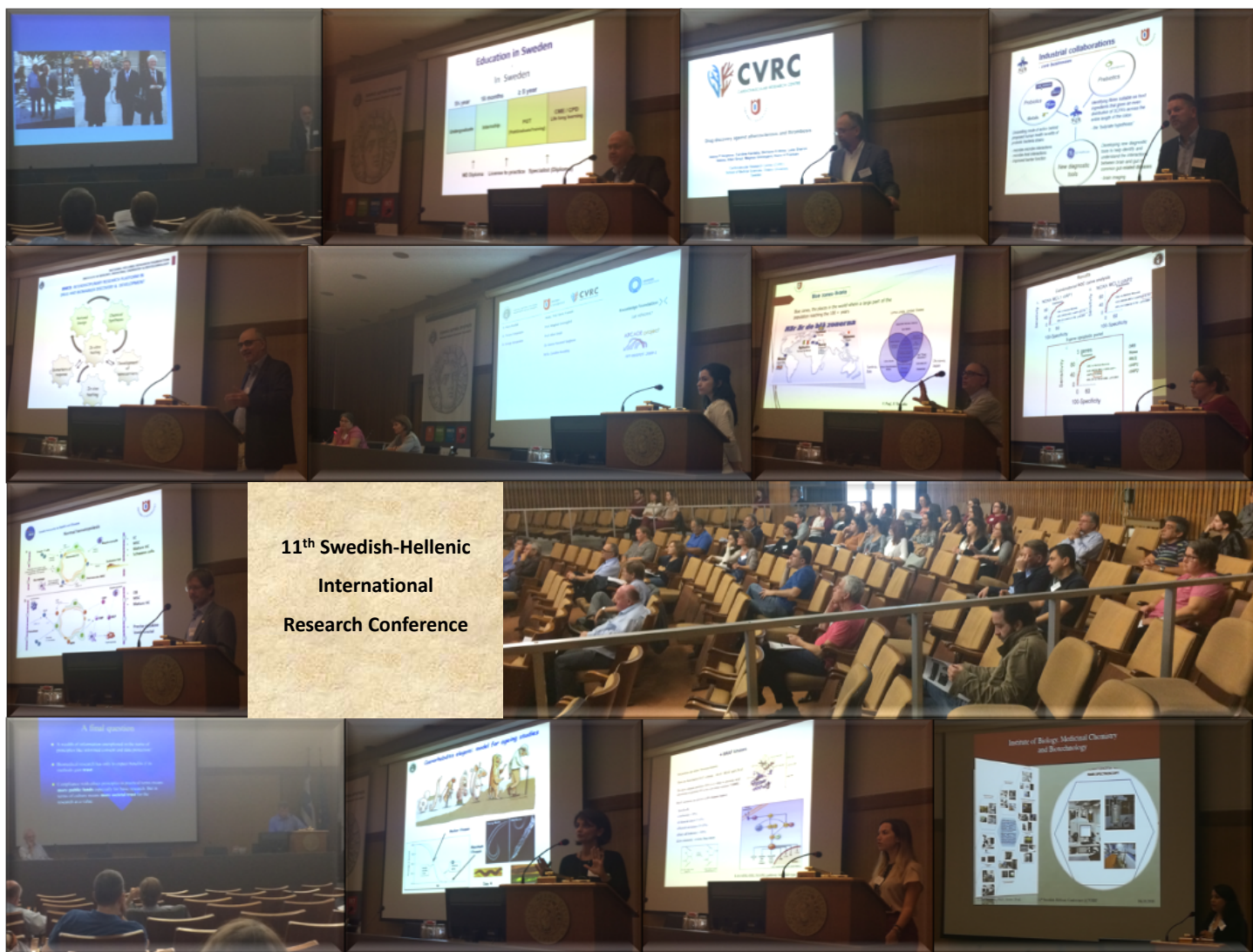
Photos from the 11 th Swedish-Hellenic Conference, held at NHRF in October 2018.